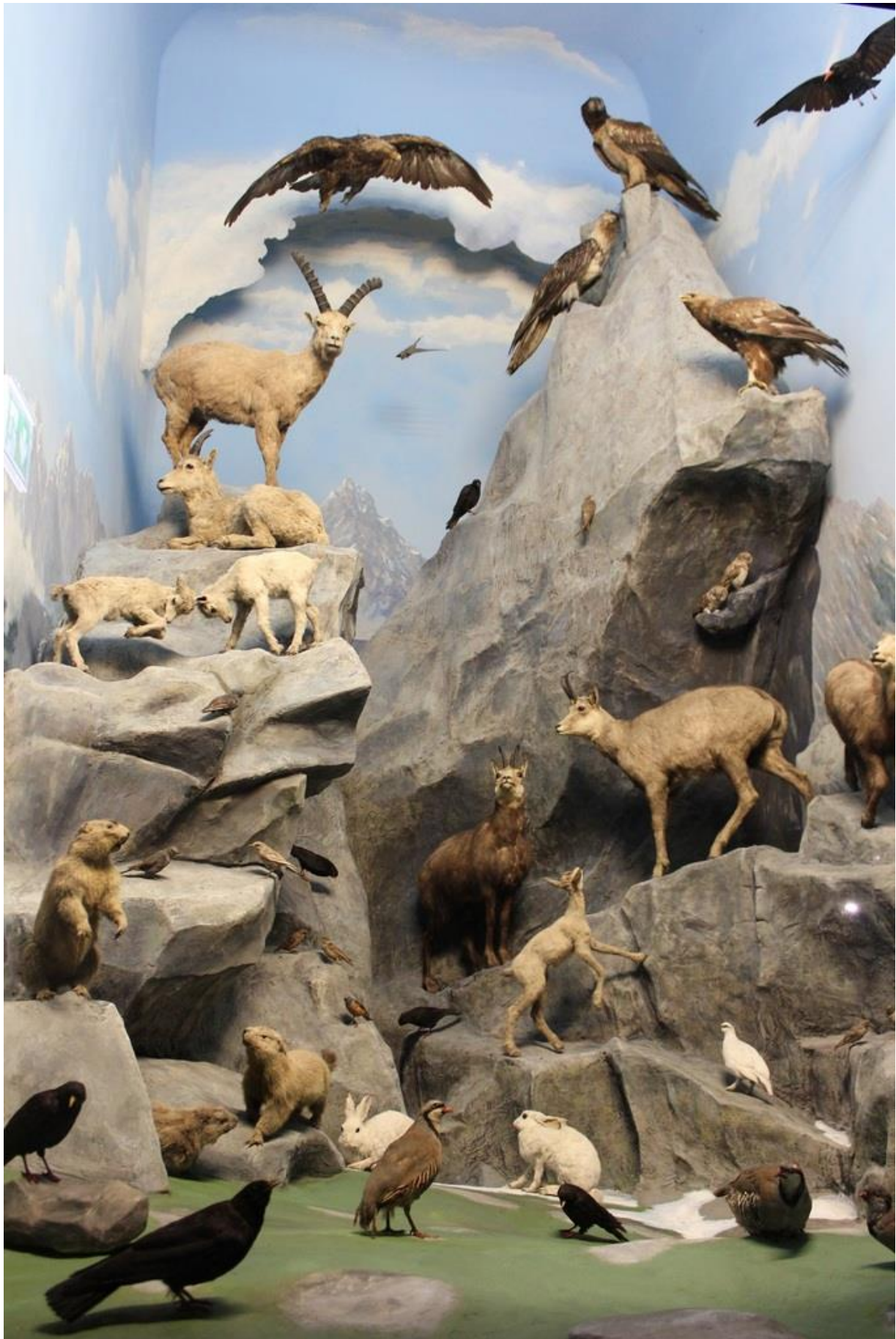
La « nature », quand tous les animaux font le spectacle ensemble...