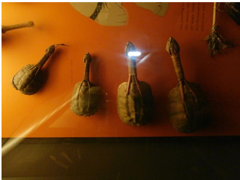
Tortues instruments de musique chez les indiens d'Amérique du Nord au Museum de NY.

Among the turtles confiscated were one angonoka tortoise ( Astrochelys yniphora ) and 14 painted terrapins, or saw-jawed turtle ( Batagur borneoensis ). The angonoka tortoise is native to Madagascar and is one of the rarest land tortoises in the world with an estimated wild population of just 600. The painted terrapin is native to rainforests of Brunei, Indonesia, Malaysia and Thailand and is a Convention on International Trade in Endangered Species of Wild Fauna and Flora (CITES) Appendix II critically endangered species, according to the International Union for Conservation of Nature (IUCN).