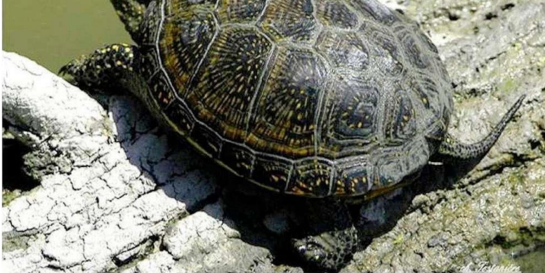
La cistude d'Europe, une espèce protégée.

Publié dans SUD-OUEST le 14/03/2014 à 0h00 par Christine Morice